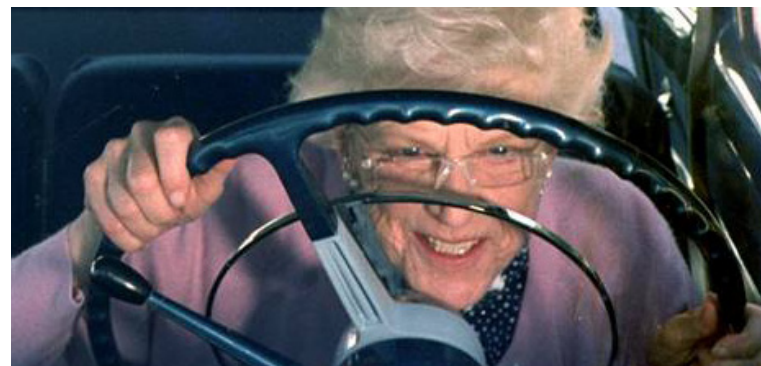
No one ever stopped to consider that maybe Grandma was the one smashing into people all this time. Today's a day for vapor trails...

being in the wrong place at the wrong time. Make it a wonderful love story, and right at the end a large tire from an exploded airplane comes through and kills the couple. Just make sure that the movies are not like Final Destination or whatever those movies were, those were not about good guys beating the bad guys! 🐻