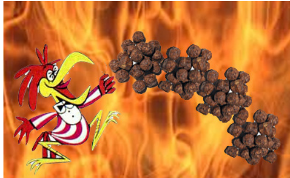
FIRE?! HERE LET ME GET THAT FOR YOU!